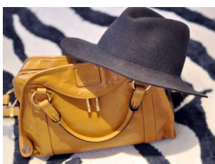
by Maegan Tintari ©