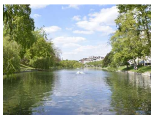
-2,800,000 views ,thank you!