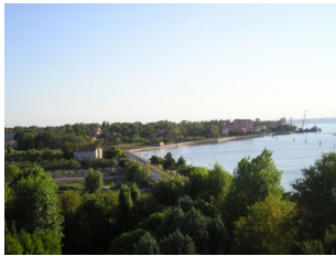
by Luca Conti