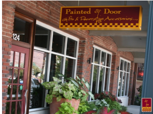
📷 by Painted Door - Bricktown