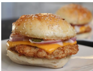
by Public Domain