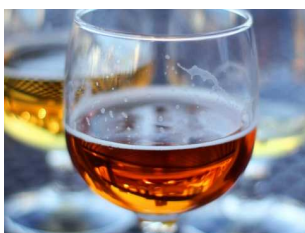
by Lindsey Gira

901 2nd And Poplar Street North 2nd Street, 2nd And Poplar Street, Filadelfia PA