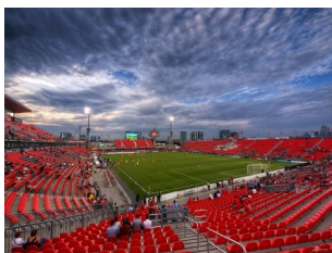
by paul bica from toronto, canada