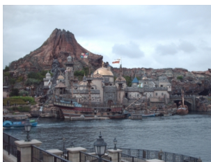
by Okwhatev at en.wikipedia